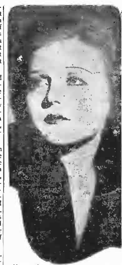
Nancy Carroll, singing and dancing comedienne of stage and screen, who is Rudy Vallee's guest artist on the Fleischmann program.

Nancy's birthday is November 19, and this, together with her Irish ancestry, should give Rudy several appropriate cues for orchestral numbers.